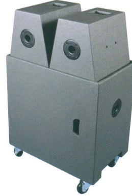
IAS-10CX / IAS-115SA Packing Status

* Speaker Stand not included with system