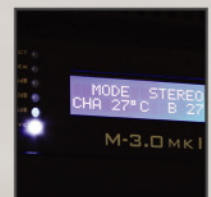
LCD Status Display