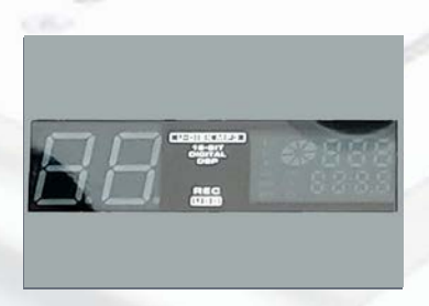
LIVE Grade Effect Engine