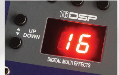
16 Digital Multi Effects