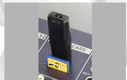
USB / SD Card Slot