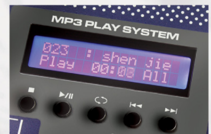
USB / SD MP3 Playback