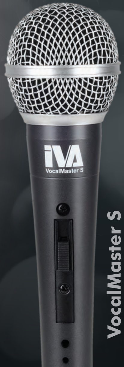
VocalMaster S (On/Off Switch Version)