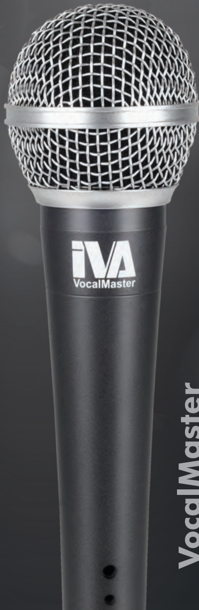
VocalMaster (Non-switch Version)